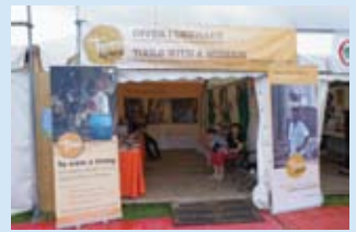
TWAM Cymru at The National Eisteddfod of Wales, August 2012